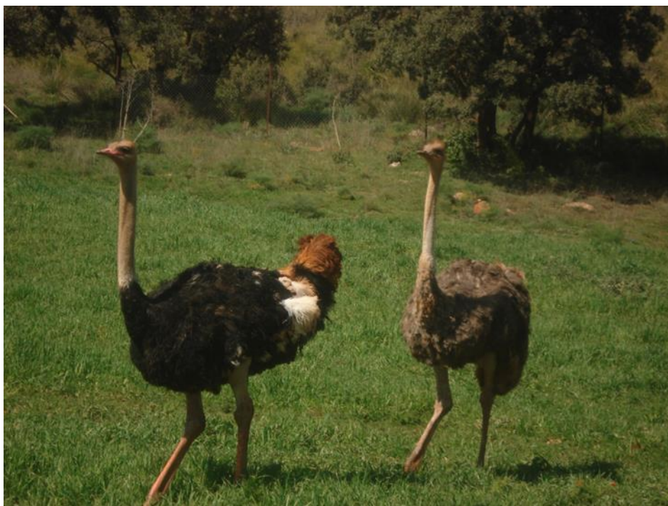
Figure 2. The couple of ostriches chosen for reproduction.

The sexual dimorphism can clearly be observed in the ostrich, as is shown in Figure 2. Indeed, one may distinctly notice that the male, which is first, has black coverts and pinnae, flight feathers and white rectrices. However, the female is smaller and entirely gray-brown (Svensson et al, 2015).