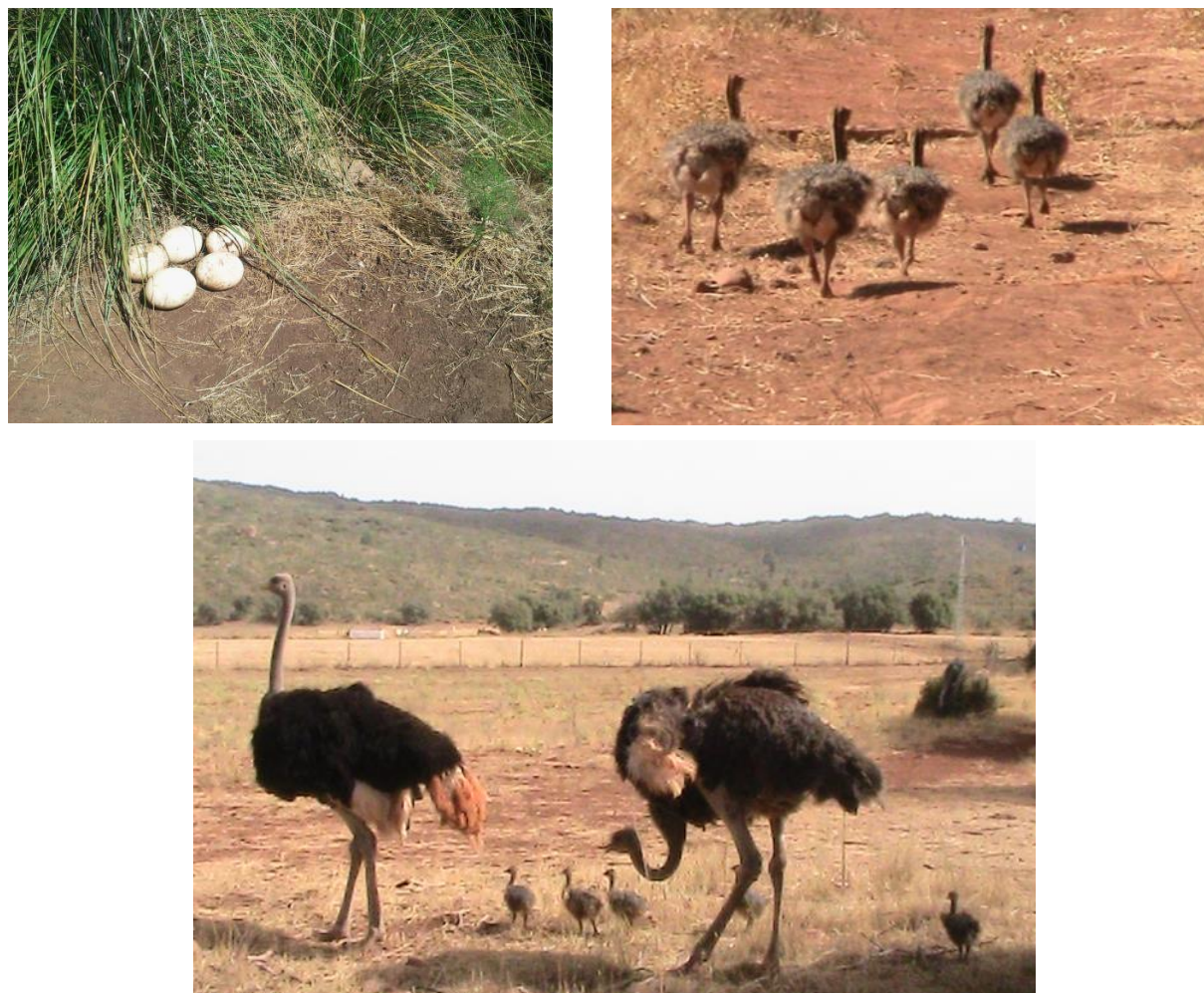
Figure. 3. Brooded and hatched eggs.