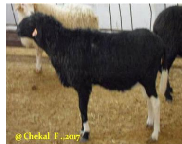
Photo 21. D'man ram in ITELV of Saïda