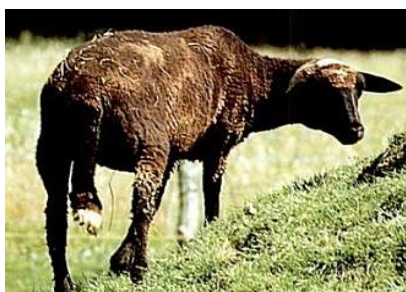
Figure 36. Black French ewe of Velay (Daniel., 2000)