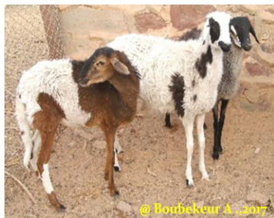
Photo 19. Female young lamb D'man à Adrar