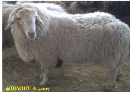
Photo 25. Barbarine ram at the ITELV of Saïda