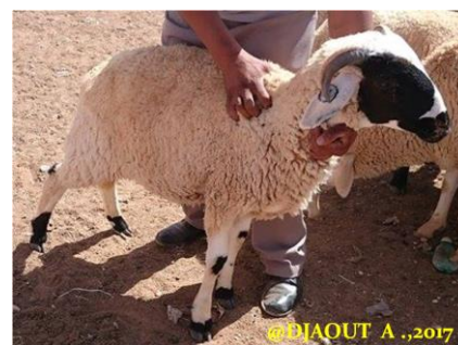
Figure 34. Srandi young ram with irregular pigmentation in the Tlemcen area