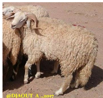
Photo 27. Taâdmit young ram in Oum El-Bouaghi