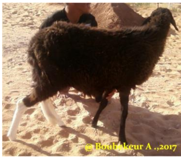
Photo 20. D'man ewe in Adrar