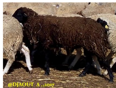
Figure 37. Black ram from Thibar to Zaghouène (Tunisia)