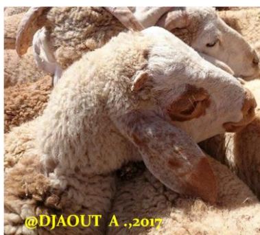
Figure 33. Srandi young ram with brown pigments in Mechria (Nama)