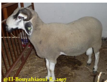
Photo 28. Tazegzawt ewe in Béjaia