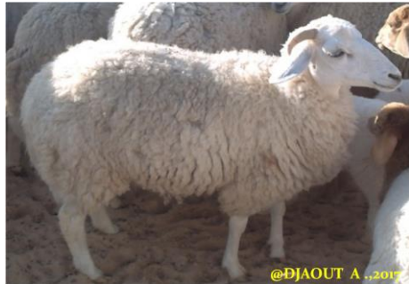
Photo 24. Barbarine ewe in the Sahara of Oued Souf

They exist inside these breed two groups: