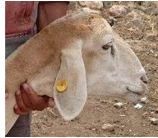
Photo 18. Red-russeted head with white spot on the neck