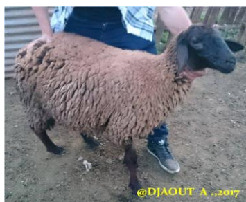
Figure 35. Darâa ewe in the region of Tlemcen

According to the breeders, the result of the cross between the Ouled Djellal and the Hamra breed gives birth to animals called Darâa who have black skin (head and legs) and white wool with black or brown spots especially at the shoulders. According to Kanoun et al. (2008), this type is called "Bakâa" in the Djelfa region.