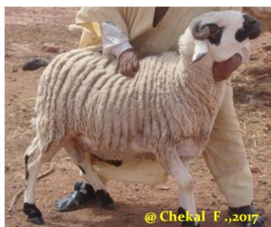
Figure 32. Srandi ram with black pigments in Naama