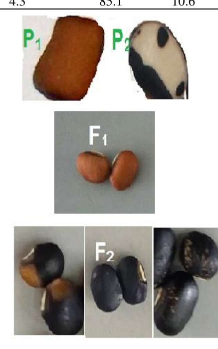
Table 4: Color characteristics of cowpea generations - parental lines, first and second filial generations of the cross Ife Brown (Brown) x TVu2723

Figure 3. Colors of cowpea generations - parental lines and crosses between Ife Brown and TVNu699 Cross between Ife Brown and TVu2723